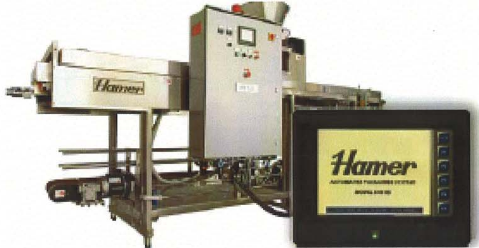
540 pictured with optional color touch screen